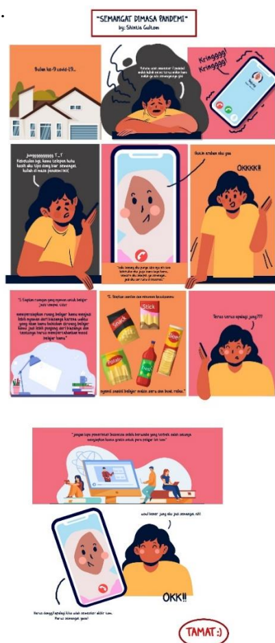
picture 4. Virtual/ online Learning

In messages that are persuasive, the content of the message is in the form of an invitation or appeal which is expected to be able to give the audience a change of attitude.