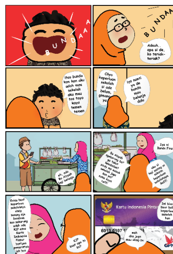
Picture 2. KIP topic

that have informative messages discuss topics about government policies, for example, KIP or Smart Indonesia cards, online learning, new student admissions (PPDB), and others.