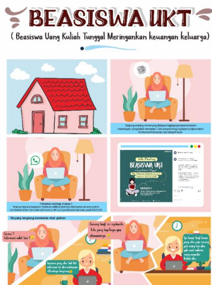
Picture 1. Comic strip